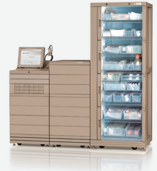
Pyxis MedStation ES system typical configuration

To learn more about the new Pyxis ES platform, Pyxis MedStation ES system and additional Pyxis technologies, ask your CareFusion sales representative or contact communications@carefusion.com .